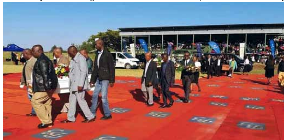
Accident victims' coffins taken to the cemetery during the mass funeral held at Tafelkop Stadium.