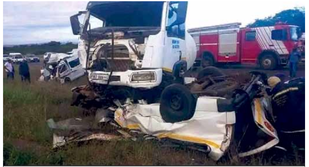
The wreckage of the minibus taxis that involved in a crash near Motetema and claim lives of 16 people including scholars.

the rules of the road at all times and ensure that their vehicles are in a roadworthy condition before they can embark on their trips," said Radzilani.