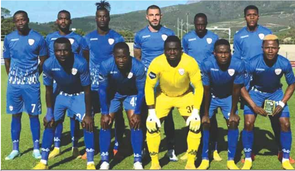
Sekhukhune United FC qualified for the Nedbank Cup quarter-finals to join the ranks of Kaiser Chiefs, Mamelodi Sundowns and Orlando Pirates.