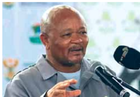
Minister of Water and Sanitation, Senzo Mchunu, said he will set up a team to investigate tender irregularities in relations to water projects in Moutse.

he has set up a team to investigate a report presented Lepelle Northern Water stating that 30 boreholes were drilled and refurbished, with 20 of them operational. The report further states that 1800 water storage tanks were installed with 20 tanker trucks procured to deliver water to communities. However, community members disputed the report and voiced a number of concerns ranging from corruption and non-functionality of water infrastructure. The minister assured the community that his office will work tirelessly to investigate the Moutse Draught Relief Projects issues and will also ensure that the current Loskop Bulk water Supply Project is not infiltrated by maladministration and corruption.