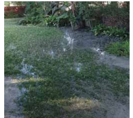
The sewer spillage has prevented AGS congregants to attend church services due to unbearable stench and health hazards.

residents whose houses are surrounded by raw effluent. One elderly gentleman who suffers from a rare blood condition is particularly vulnerable as unhygienic surroundings can be fatal," informed Jacobs. Jacobs furthered a multi-party delegation visited the area led by Ephraim Mogale Mayor, Given Moimana, who undertook to liaise with Sekhukhune District Municipality to urgently clear up the spill and repair the infrastructure. "We are not holding our breath. The DA is now insistent that the SAHRC execute its mandate, which includes investigating and reporting on the observance of human rights, taking steps and securing appropriate redress where human rights have been violated. The people of Ephraim Mogale's rights have been disrespected long enough," concluded Jacobs.